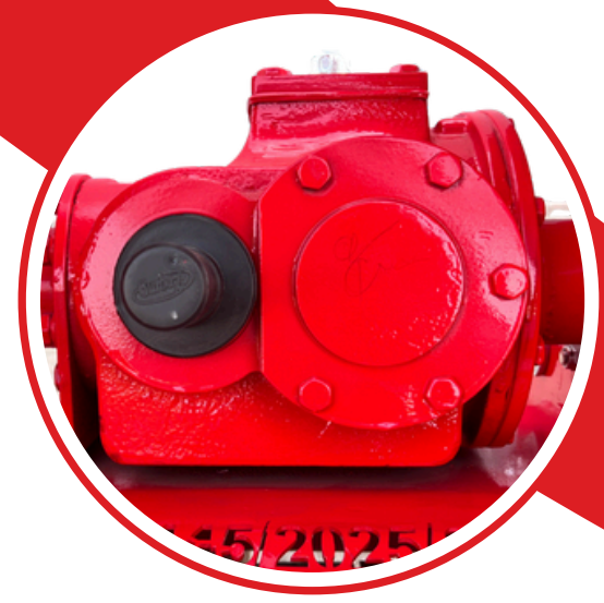
13 x 23 GEARBOX