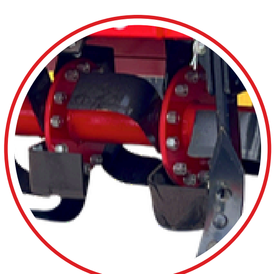
BORON STEEL BLADES