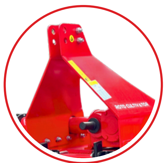
HEAVY DUTY 3 POINT LINKAGE HITCH