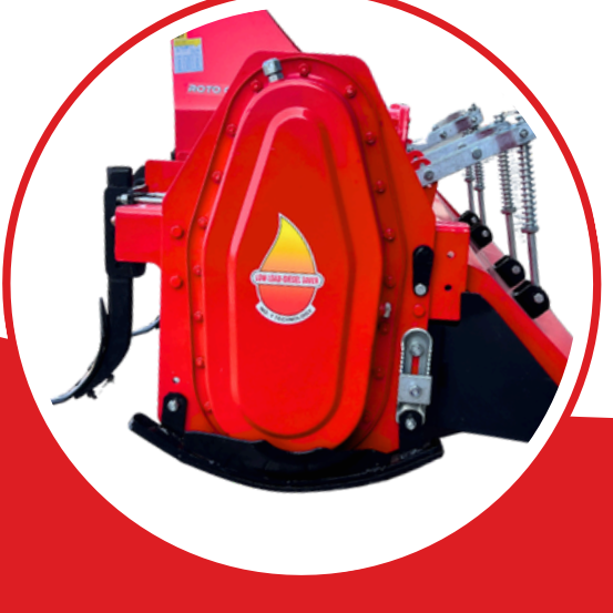
20/35/28 SIDE GEAR